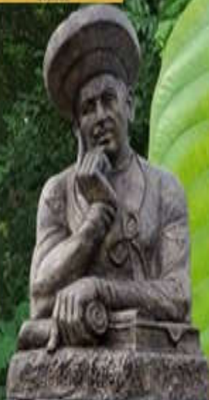
NARMADASHANKAR LALSHANKAR DAVE (24 Aug. 1837 – 26 Feb. 1880) A Great Gujarati Poet, Reformist